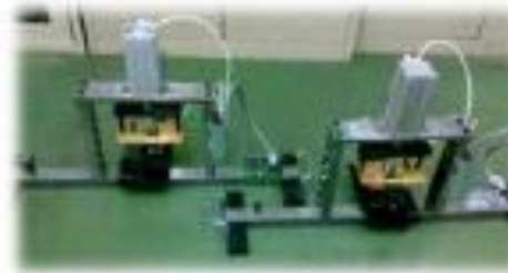
FIXTURE PRESS PIN