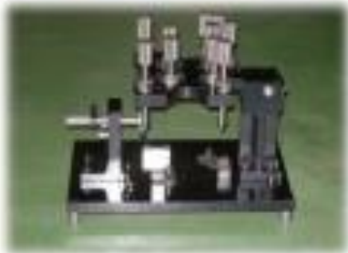
JIG CHECK HOLE