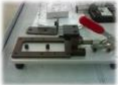
JIG ASSEMBLY WELDING